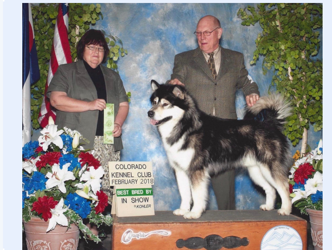
PHOTO OF SIRE (Add below): Download free Foxit Reader. This will enable you to place photo in document. See instructions on last page.